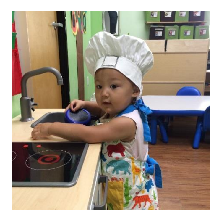
Friendly reminders : Don't forget to read your child's daily sheet, look for any material that they will be needing. Thank you!