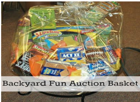
Backyard Fun Auction Basket